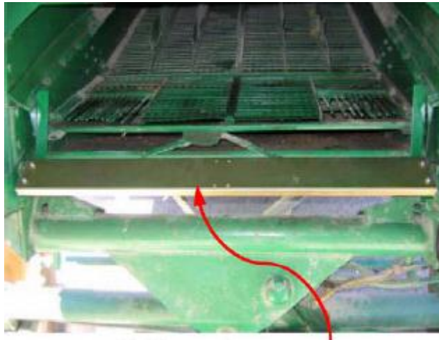
Fig. 1. Upper sieve sensor of John Deere 955

JOHN DEERE, CASE IH and other foreign companies[1,2] generally install a rectangular or circular iron plate at the end of cleaning sieve, and then set up a piezoelectric ceramic in its central position[3](see Fig.1). When a drop of seed impacting on the iron plate, a mechanical vibration is generated with being converted into a pulse signal by the piezoelectric transducer and signal processing circuit. Then at last we can obtained grain loss through amplitude discrimination processing. But this method is often limited to the choice of sensor material because different materials are not the same for the vibration maximum amplitude and different grains reflection on the same type of sensors are not also the same. In addition, a single sensor can only make us obtain the grain loss of the effective area.